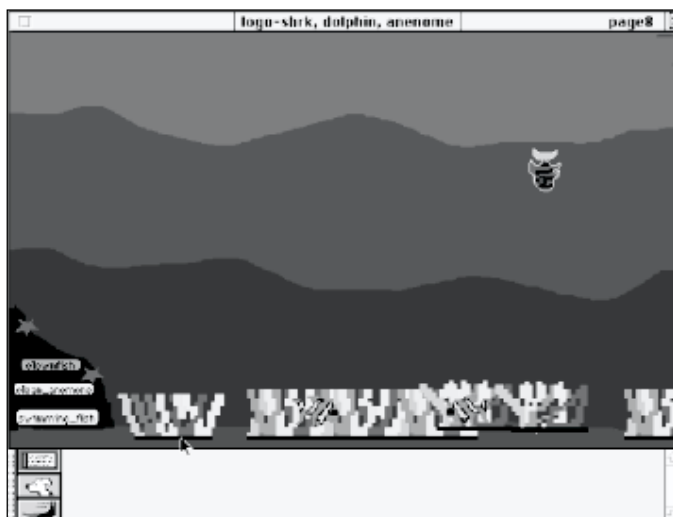
Figure 3. This simulation illustrates adaptive behaviors by showing clownfish safely swimming among sea anemones. The clownfish behavior attracts another fish, which believes the anemones to be safe. The fish is stung and eaten by one anemone.

recent marine biology unit were “food webs” and “how do animals adapt to different conditions in the oceans?” These request items coincided with my overarching goals for student learning, so I planned specific lessons on food webs and adaptation.