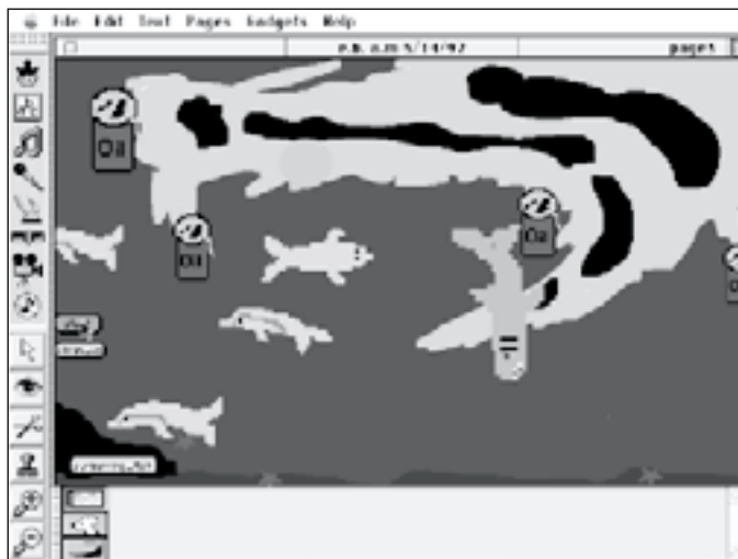
Figure 2. These screens show oil spilling into the ocean. The simulation shows dolphins ingesting the oil and the resulting toxic effects.